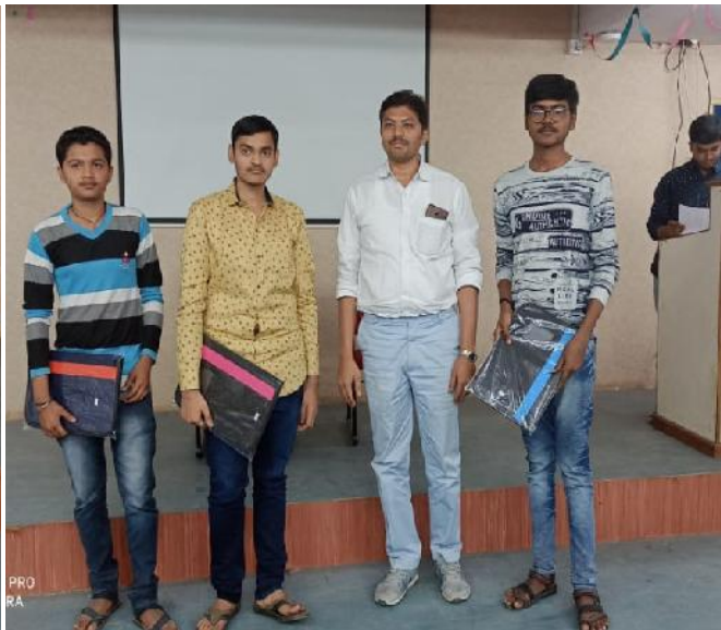
"Ek Bharat Shrestha Bharat"